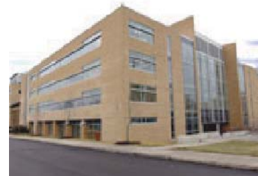
Pavillon Jean-Coutu, Université de Montréal 2940, chemin de Polytechnique, Montréal

Sponsored by MultiTes, Vocabulary Management Software